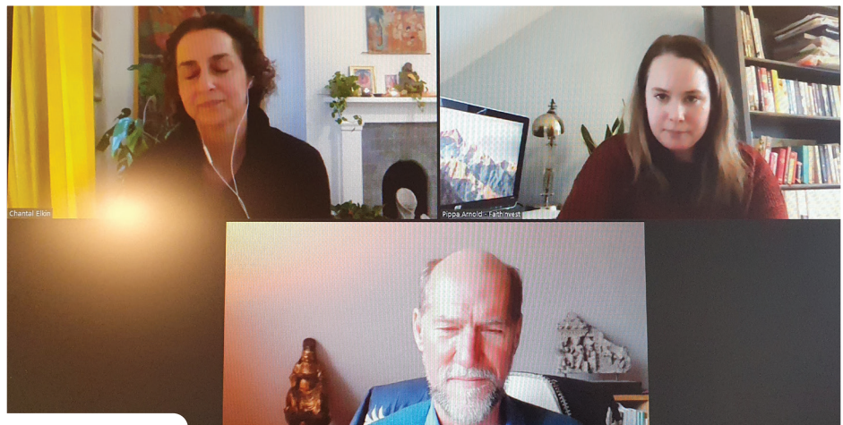
| Programme 1