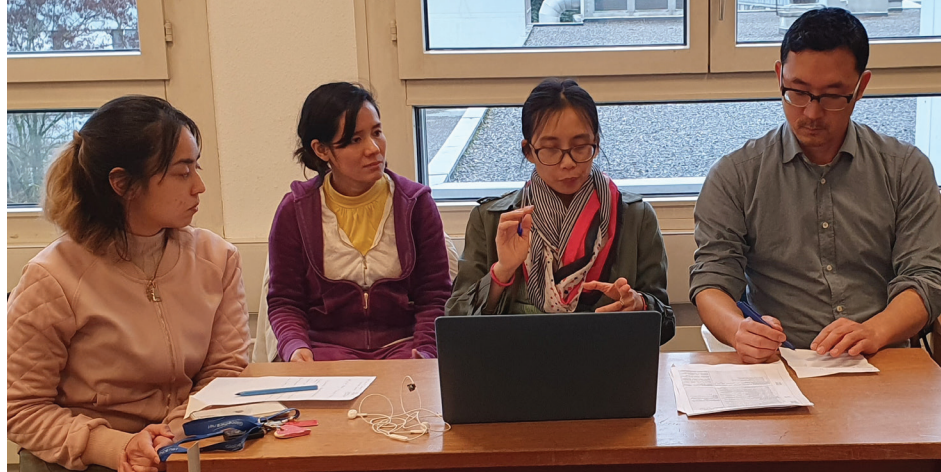
| Programme 3